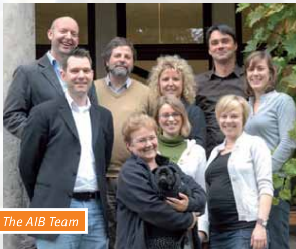
The AIB Team

info@aib-studyabroad.org www.aib-studyabroad.org